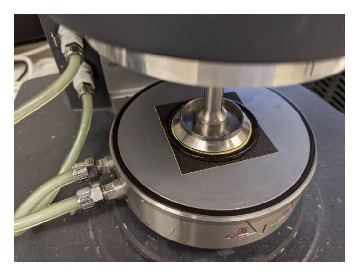
Parallel Plate Rheometer for liquids over a large temperature range

Rheometers work by applying controlled deformation or stress to a material and measuring the resulting response. The deformation can be applied in various ways, such as through rotational or oscillatory motion, shear flow, compression, or extension. The resulting response can be measured in terms of parameters such as viscosity, elasticity, shear modulus, yield stress, and other rheological properties.