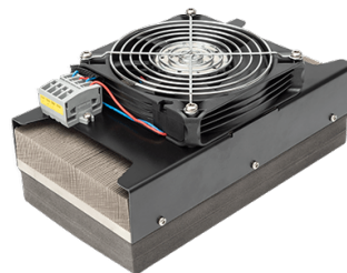
SuperCool X Series

When used with a temperature control unit, Peltier cooling assemblies offer several advantages over other cooling technologies including cooling below ambient temperatures, fast ramp rates, precise temperature control, accurate to within \pm 0.01^\circ\text{C} under steady-state conditions, and low noise. These temperature control systems are also environmentally friendly, as they do not utilize refrigerants to achieve accurate temperature control inside the centrifuge.