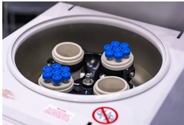
Centrifuges use centrifugal force to separate mixtures.

To meet a variety of sample volume, g-force and revolutions per minute (RPM) requirements, centrifuges are offered in a variety of models. These include sophisticated ultracentrifuges, high-speed centrifuges, large capacity centrifuges and smaller benchtop centrifuges. In terms of thermal management, there are two types of laboratory centrifuges. Standard ventilated centrifuges are capable of managing the temperature in the bowl and their effectiveness depends on the design of centrifuge. High-end refrigerated centrifuges that offer thermal management for samples require temperature control beyond ambient conditions. Many sample types require precision temperature control inside the centrifuge chamber. This is especially true for sensitive live cells and proteins that must be stored and tested at specific consistent temperatures to ensure proper reaction and viability.